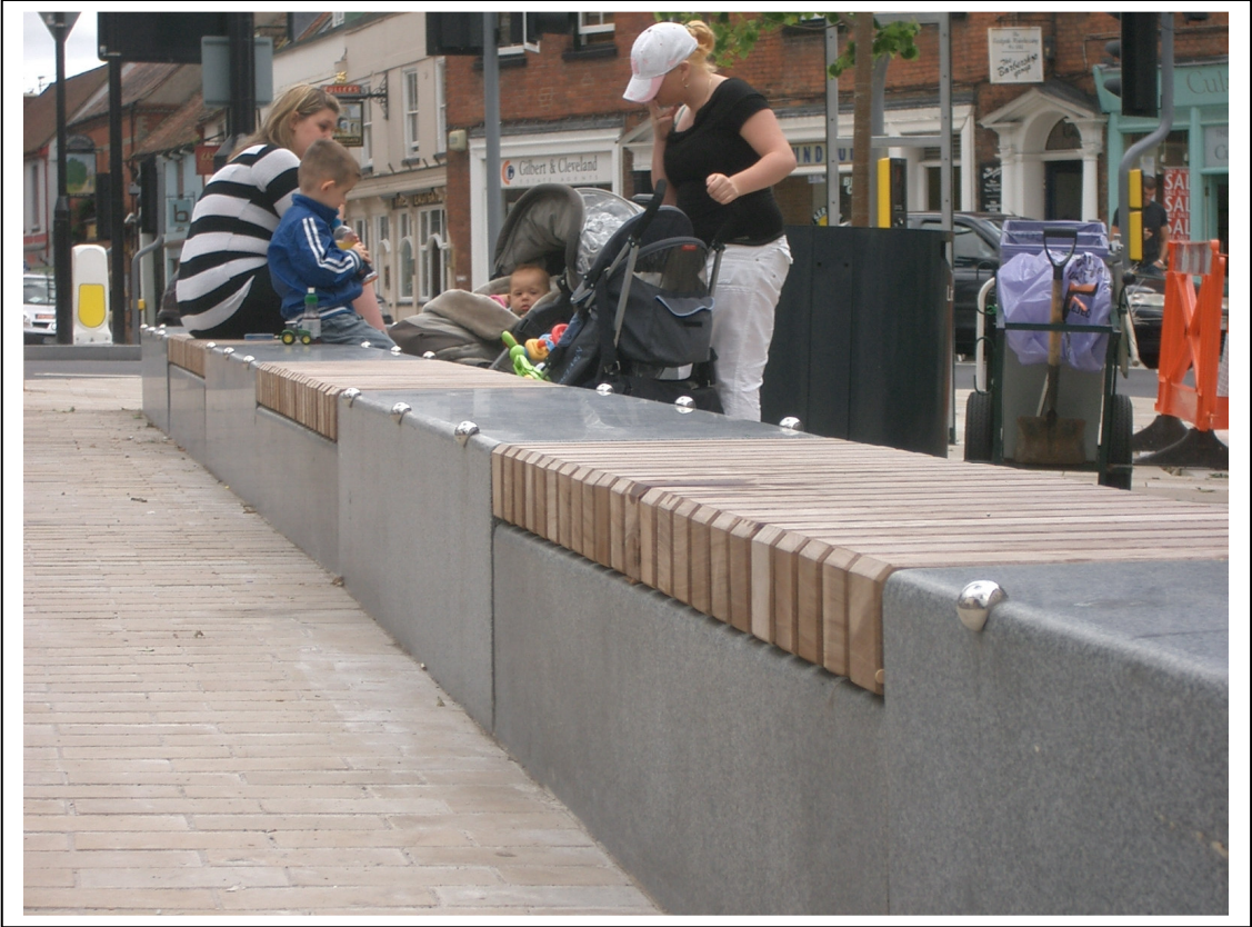
Example of granite benches with wooden panels