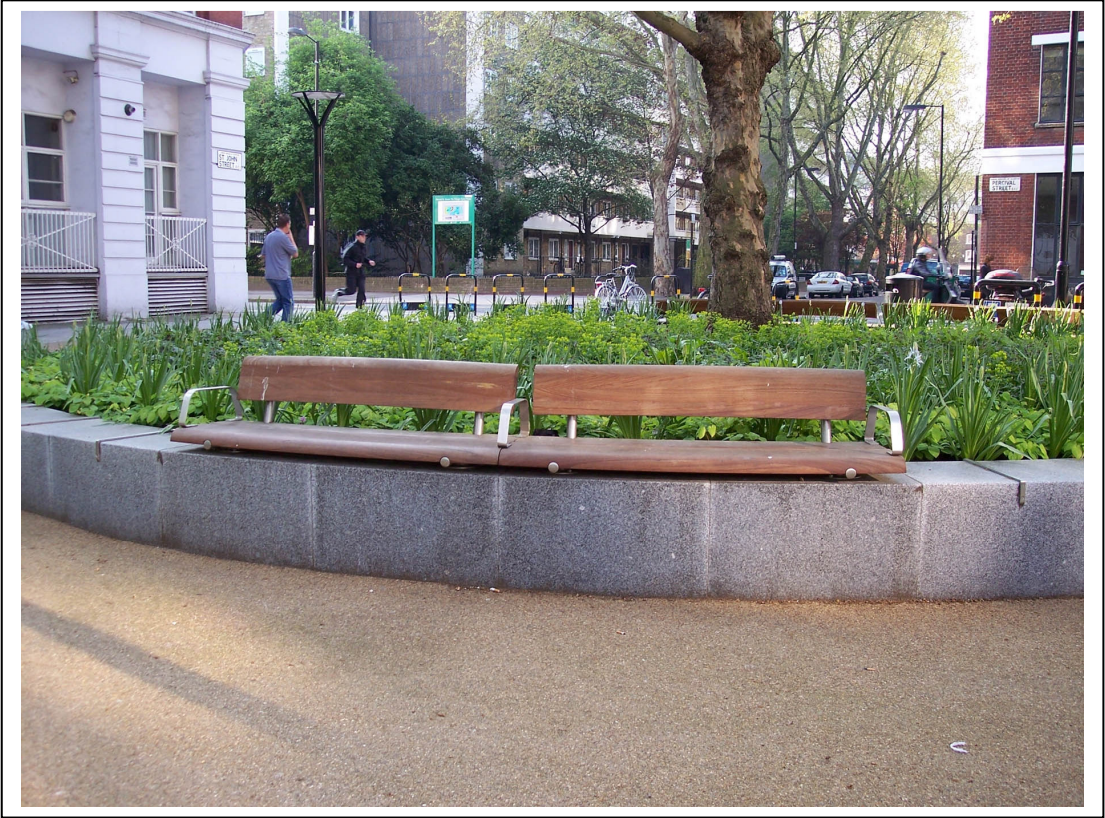
Example of granite benches with wooden seats