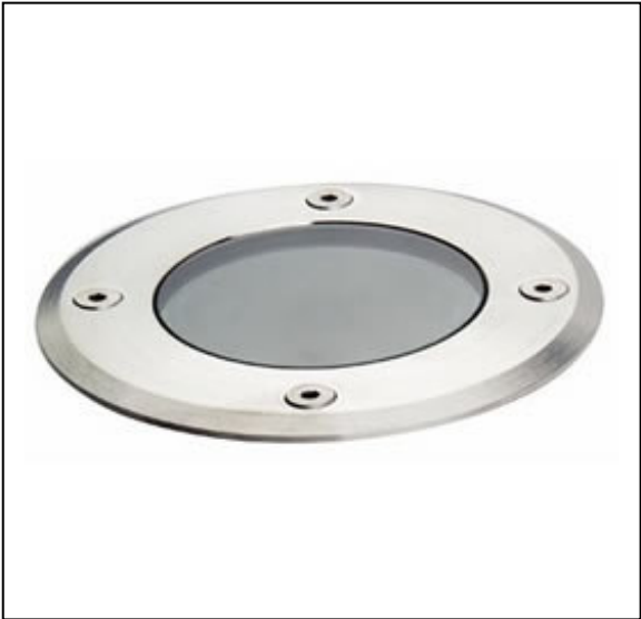
Example of pavement up light for trees